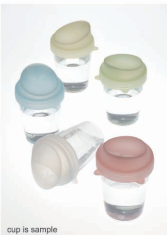
cup is sample