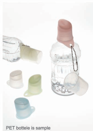
PET bottle is sample